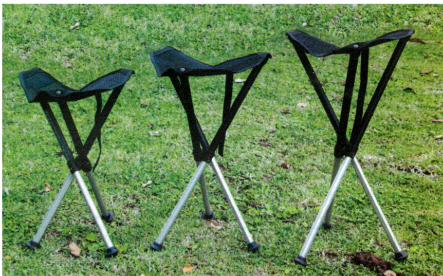
Above: Walkstools come in four heights – I tested the 55cm, 65cm, and 75cm stools.

930g – light enough for belt-carry for which loops are provided. (The 'Basic' model is rated to carry 175kg.)